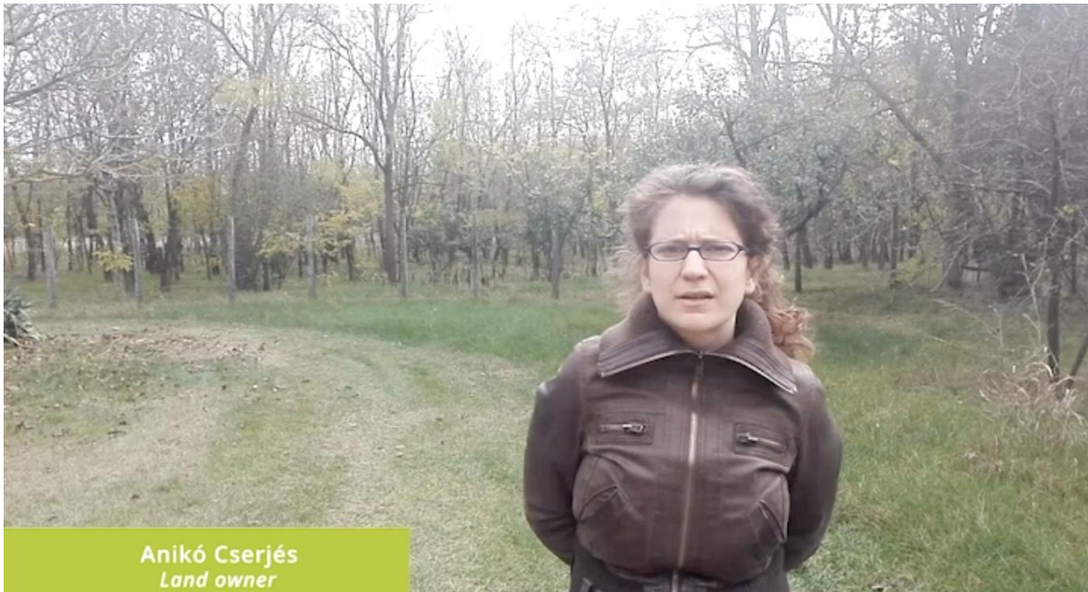
Picture 2 – Screenshot from the stakeholder video interview in Hungary

Link to the video interview: https://www.youtube.com/watch?v=AhkEk4WXxLI