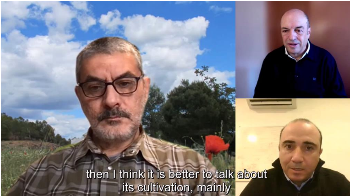
Picture 5 – Screenshot from the stakeholder video interview in Spain

Link to the video interview: https://www.youtube.com/watch?v=CbPrhUI1wRI