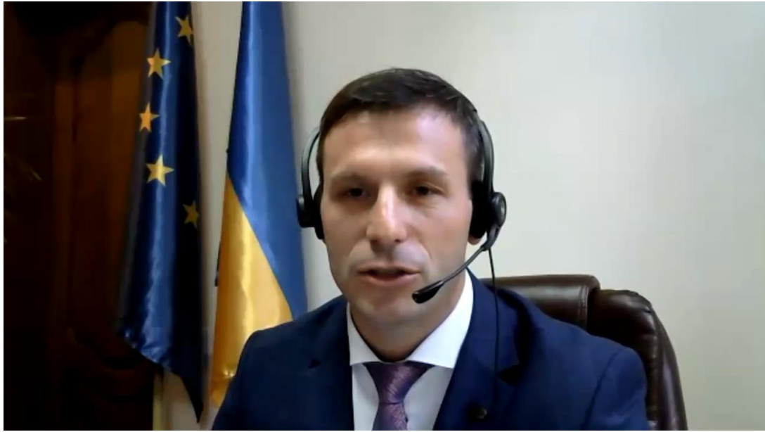
Picture 7 – Screenshot from the stakeholder video interview in Ukraine (part 2)

Link to part 1 of the interview: https://www.youtube.com/watch?v=0dD4yADWtIM